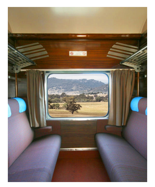
Compartments aboard the airconditioned Spirit of Progress are comfortable with plenty of leg room and luggage racks