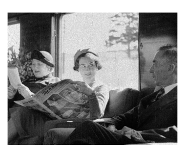
Passengers relax in the First Class Parlor Car on the inaugural run of the Spirit of Progress in November 1937

The Spirit of Progress features original 1937 compartment seating cars, Parlor Car and is hauled by heritage diesel locomotives