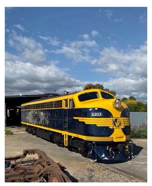
S303 is rests at its home at Seymour, ready for its run with the Spirit of Progress

The Helmeted Honeveater (Lichenostomus melanops cassidix) is the state bird of Victoria