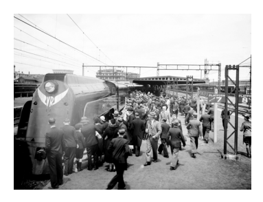
Originally hauled by steam, the Spirit of Progress departs Melbourne with locomotive S302 'Edward Henty' on its inaugural run to Albury in November 1937

disembark Sapphire Princess at Circular Quay in Sydney - B