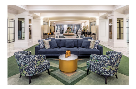
Hotel SAVOY on Little Collins is a stylish and convenient base for exploring Melbourne