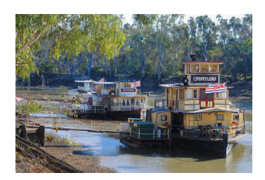
Enjoy a Murray River cruise aboard a paddle steamer from Echuca

The train returns to Bendigo to pick up locomotive R761 before returning to Melbourne's Southern Cross Station and the end of your adventure mid afternoon - B,L