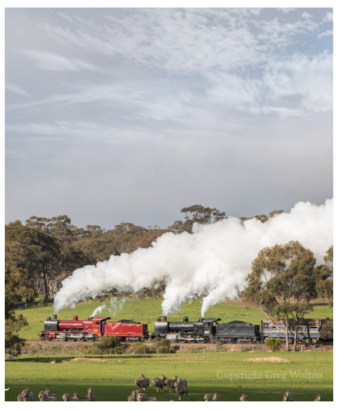
K153 & K190 of 1922 steam 'double headed' through the Victorian countryside. Both locomotives feature as part of this tour.