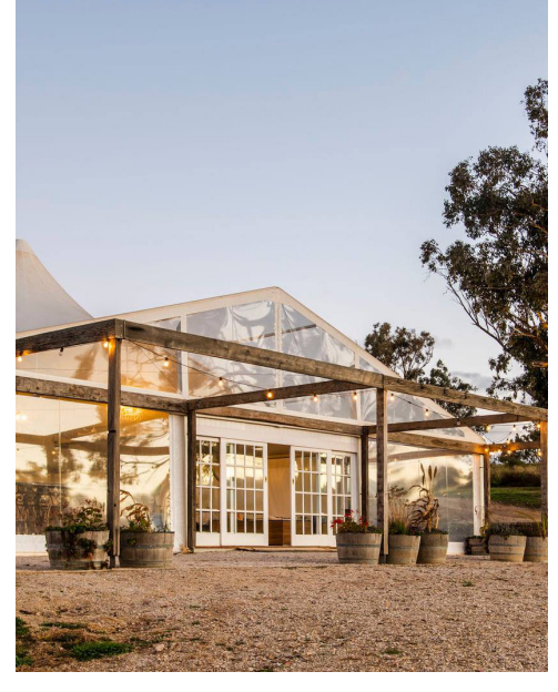
Enjoy a gala dinner at the Pavilion at Lowe featuring premium small batch wines from their certified organic and biodynamic property

Rail motor 621/721 winds its way through the picturesque Capertee Valley on it's way to Rylstone