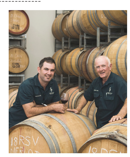
Enjoy tastings at Robert Stein Winery and explore their unique motorcycle collection