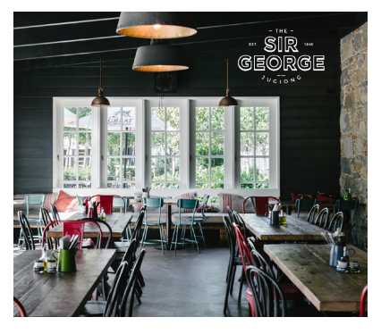
Enjoy a welcome dinner at the Sir George Hotel at Jugiong

Enjoy a private tour and wine tastings at Berton Winery at Yenda