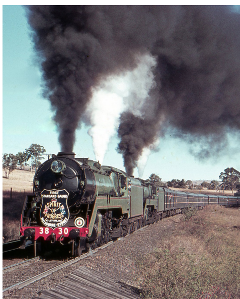
Locomotives 3830 and 3813 haul the inaugural Spirit of Progress into NSW on 15 April, 1962.