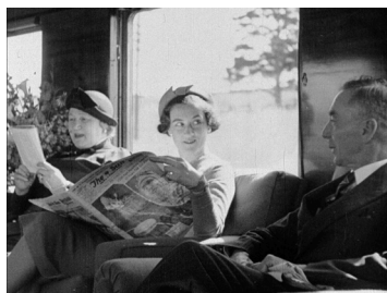
Passengers relax in the First Class Parlor Car on the inaugural run of the Spirit of Progress in November 1937

A short stop will be made at Goulburn before the train heads through the Southern Highlands and into Sydney for its historic arrival at Sydney Terminal.