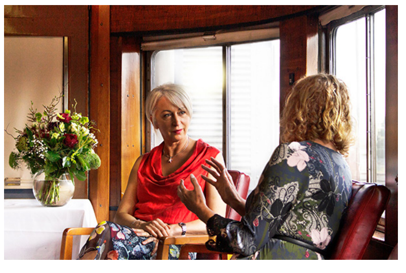
Parlor Car aboard the Spirit of Progress is open to all passengers. It is a convivial place to enjoy the passing countryside