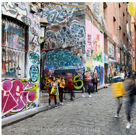
Right - See Melbourne in an entirely different light with a small group walking tour taking in the history and laneways of this fascinating city