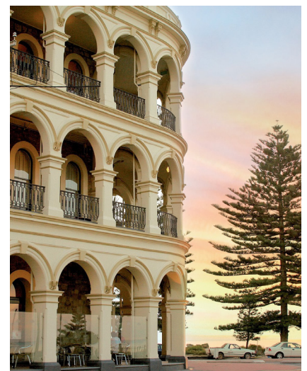
Above - Enjoy dinner and drinks at the historic Largs Pier Hotel

Leaving Albury we will soon pass Wagga Wagga and Junee before the rail motor climbs the unique Bethungra Spiral. We'll stop at historic Cootamundra West Station for lunch before travelling through the Cullerin Ranges to Goulburn for a short stop. We anticipate a mid-evening arrival at Sydney Terminal at the end our epic and spectacular adventure - B,L,D