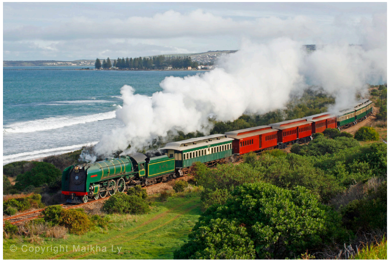
Above - Former South Australian Railways steam locomotive 621 'Duke of Edinburgh' enroute from Mount Barker to Victor Harbor on the Steamranger Heritage Railway

After breakfast transfer by coach to Mount Barker railway station. Board our Streamranger Heritage Railway privately chartered steam-hauled train for a thrilling journey all the way to Victor Harbor. There is free time to explore and have lunch before returning to the train for the journey back to Mount Barker. Transfer to Mount Lofty for dinner at the spectacular Summit Cafe. Overnight: Ibis Adelaide (or similar) - B,D