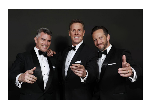
Rat Pack Reloaded stars three of the entertainment industry's most accomplished leading men who have starred in music theatre, television and film right across the globe