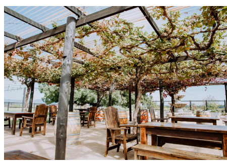
Enjoy lunch at Augustine in delightful surroundings with long views to the Mudgee hills

Heritage railmotors CPH 1,3 & 7 entered service in 1923. Beautifully restored they provide a unique and authentic way of travelling with windows that open allowing you a better connection with your surroundings