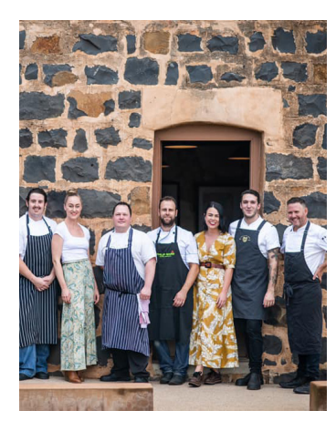
A highlight of the tour is dinner at Philip Shaw Winery in Orange - a fitting farewell dinner to this spectacular tour of NSW

Rejoin your heritage train and travel to Bathurst where you'll enjoy lunch at the nearby Victoria Hotel. Entry is included into the new Bathurst Rail Museum. Continue to Lithgow where a short stop will be made before you make your mid-evening arrival back into Sydney - B,L,LD