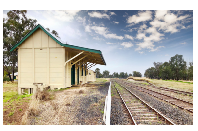
Stop at Premer - one of two stations still in existence between Werris Creek and Binnaway

Millthorpe is a beautiful heritagelisted village 20 minutes east of Orange where we will enjoy free time to explore and lunch at Tonic Restaurant