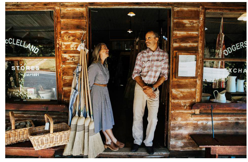
Visit beautiful Nundle for lunch and tour the local Woollen Mill, shops and enjoy afternoon tea at historic Wombramurra Homestead