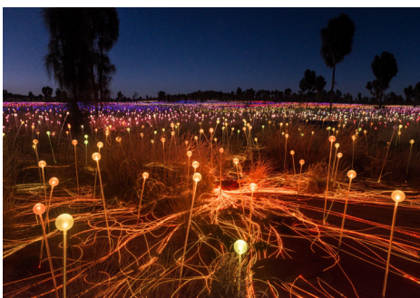
Enjoy a concert by Opera Australia accompanied by a chamber orchestra at the Field of Light art installation at Uluru

Reboarding our aircraft we'll head for the Western Queensland outpost of Longreach to visit the Qantas Founders Museum with its collection of historic aircraft, including the Avro 504K, the first plane ever used by the airline. Our aircraft will then continue to Melbourne and the end of our adventure - B,L,LD