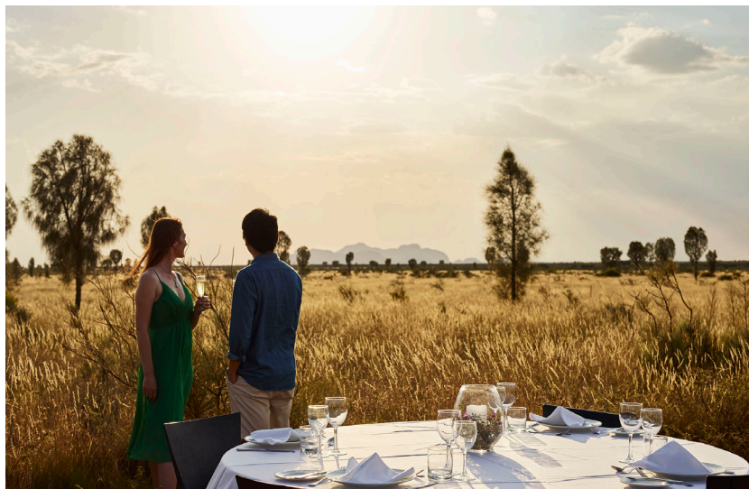
Dine in the outback at the Sounds of Silence dinner with spectacular views