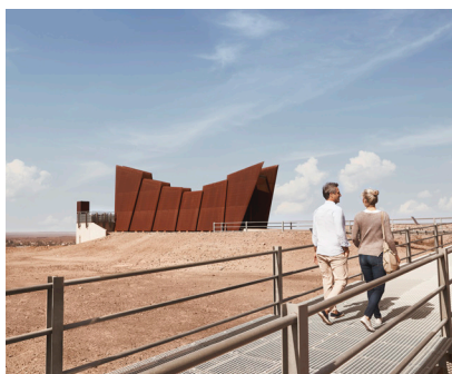
Visit the unique and quirky town of Broken Hill for a tour including the Line of Load Memorial (pictured)