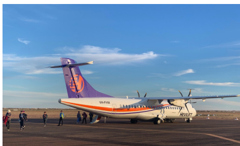
With no more than 48 passengers enjoying 68 seats, the ATR-72-500 is an overwing aircraft providing the perfect views for everyone