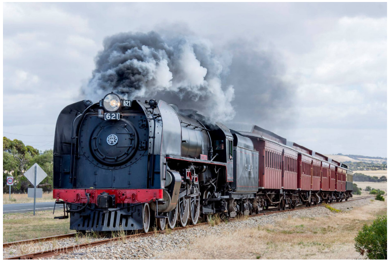
Above - Former South Australian Railways steam locomotive 621 'Duke of Edinburgh' enroute from Mount Barker to Victor Harbor on the Steamranger Heritage Railway

After breakfast transfer by coach to Mount Barker railway station. Board our Streamranger Heritage Railway privately chartered steam-hauled train for a thrilling journey to Victor Harbor. There is free time to explore and have lunch before returning to the train for the journey back to Mount Barker. Transfer to Mount Lofty for dinner at the spectacular Summit Cafe. Overnight: Ibis Adelaide (or similar) - B,D