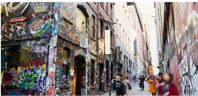
Above - See Melbourne in an entirely different light with a small group walking tour taking in the history and laneways of this fascinating city