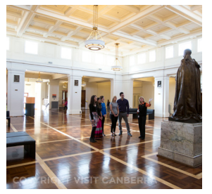
Enjoy a private tour of the Museum of Australian Democracy and lunch at Old Parliament House