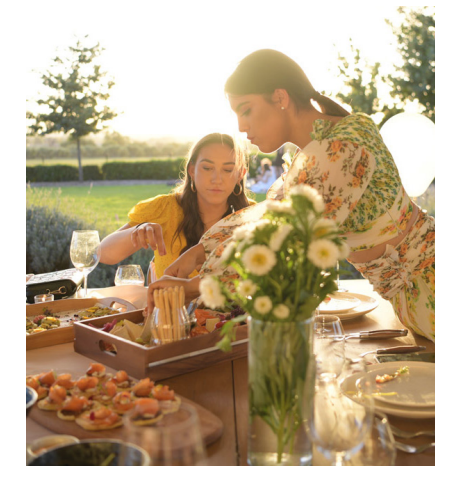
Enjoy dinner at Pialligo Estate with matched wines

Our unique weekend getaway by 1920s railmotors will showcase well known and must see sights as well as local food and wine producers. It's one good thing after another!