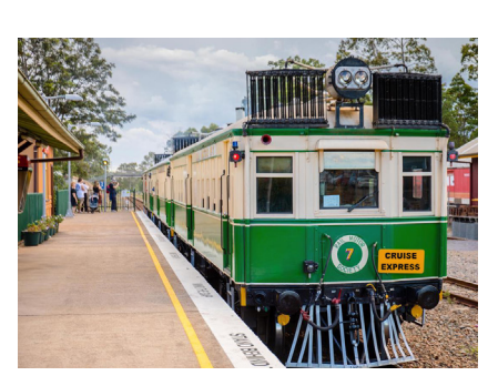
CPH 1,3 & 7 are three of a class of 37 railmotors built in the 1920s. This will be the first time all three have been to Canberra, and the first time ever for CPH 3.

Reboard the railmotors and journey to Goulburn for a quick leg stretch before returning to Sydney, Gosford or Broadmeadow - B , L