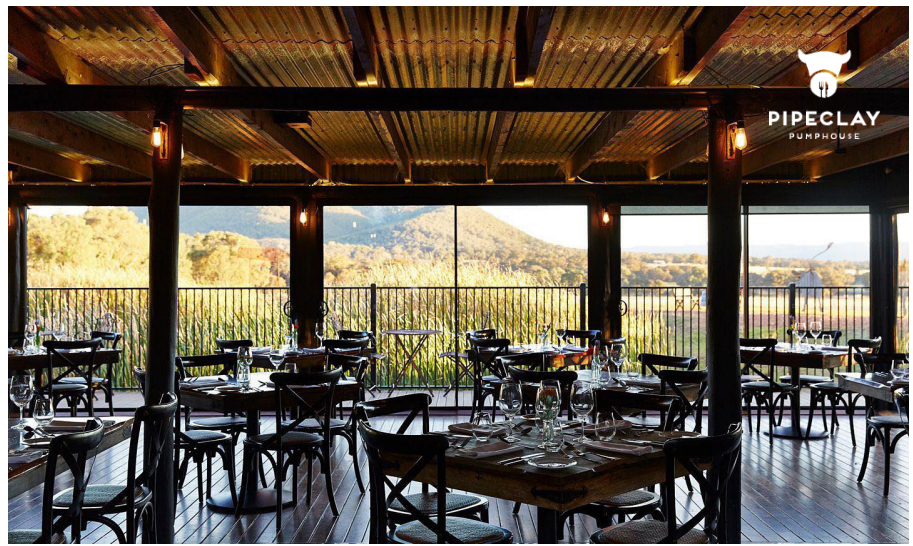
Enjoy a spectacular dinner at Pipeclay Pumphouse with matched Robert Stein wines

After breakfast return to Rylstone to rejoin the train for your return journey through the Capertee Valley and Blue Mountains to Sydney - B,L