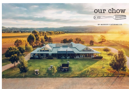
Dinner at Our Chow hosted by Mudgee Catering Co.