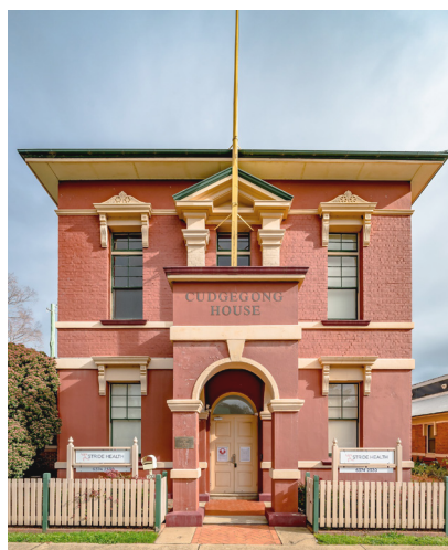
Explore historic Gulgong including its famous Prince of Wales Opera House