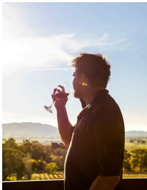
Our Mudgee stay includes a town tour, time to shop, visit fascinating local museums and explore at leisure