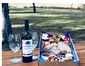
Lunch at Lazy Oak Vineyard includes a gourmet grazing box with wine in spectacular surroundings