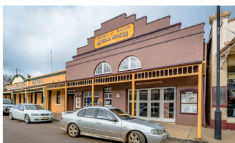
Visit the historic Prince of Wales Opera House in Gulgong

After breakfast, we return to Rylstone by coach to board our awaiting railmotors and re-trace our journey through the Capertee Valley and the Blue Mountains. The railmotors will set down at Sydney Terminal, Gosford and Broadmeadow - B,L