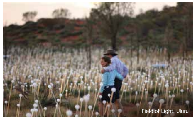
Field of Light, Uluru

*Conditions apply. SEE: aptouring.com.au/SpecialDeals for full conditions. Book by 31 March 2022 unless sold out prior. Prices are per person (pp), AUD, twin share and are inclusive of an Early Payment Discount, as well as any other applicable dollar savings. Prices correct as at 9 September 2021. Price based on AAMD7: 25 July 2022. Price inclusive of a $300 pp Early Payment Discount which is valid when you book and pay in full 10 months prior to departure date. OFFERS: Limited seats and offers on set departures are available and subject to availability. DEPOSITS: A non-refundable deposit of $500 pp is due within 7 days of booking. *Tour operates in reverse Darwin to Melbourne. Australian Pacific Touring Pty Ltd. ABN 44 004 684 619. ATAS accreditation#A10825. APT-2704-AAMD7