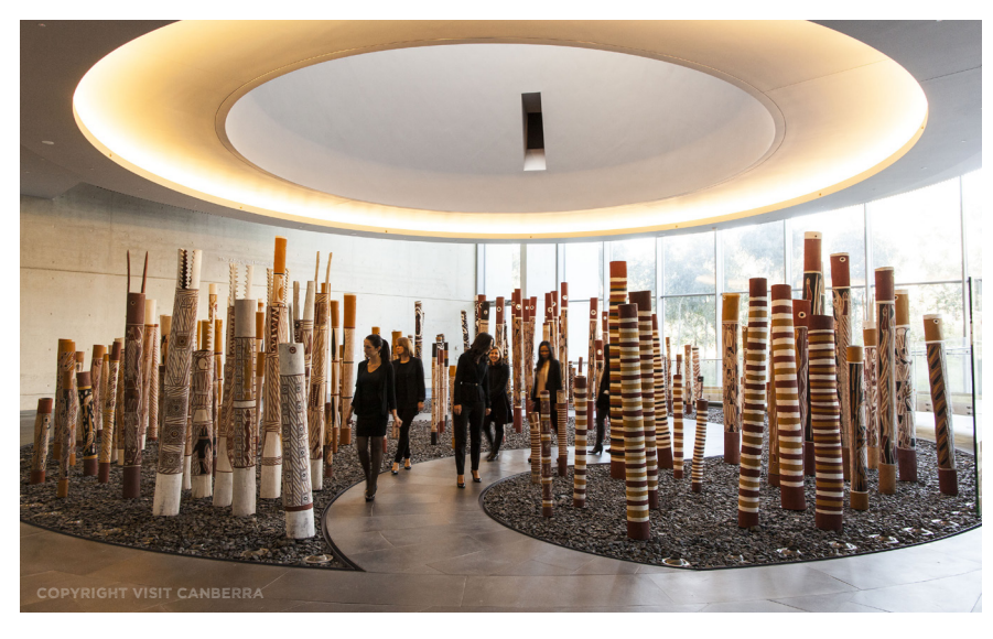
Our visit to Canberra includes visits to several must see sights such as the National Museum of Australia