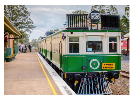
CPH 1,3 & 7 are three of a class of 37 railmotors built in the 1920s. This will be the first time all three have been to Canberra, and the first time ever for CPH 3.

Reboard the railmotors and journey to Goulburn for a quick leg stretch before returning to Sydney, Gosford or Broadmeadow - B,L