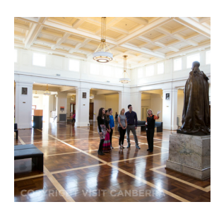
Enjoy a private tour of the Museum of Australian Democracy and lunch at Old Parliament House