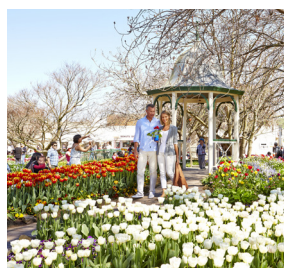
Explore the spectacular tulip displays in Bowral at Tulip Time with time at leisure to explore the nearby stores