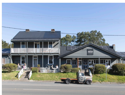
Enjoy lunch at Robertson Public House with free time to explore this charming village