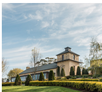
Our gala dinner and performance is at the beautiful Centennial Vineyards in Bowral

After breakfast, we rejoin our railmotor at Moss Vale and head back through Robertson where the train will begin its scenic descent down the escarpment to Unanderra. The train will then continue to Sutherland** before returning to Sydney Terminal, Gosford or Broadmeadow - B,L