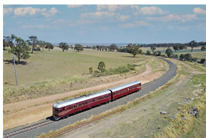
Heritage railmotor 621/721 entered service in 1961. Beautifully restored, it provides an authentic way of travelling with windows that open, allowing you a better connection with your surroundings