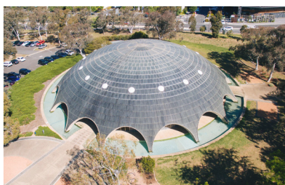
Enjoy dinner at the unique mid-century Shine Dome