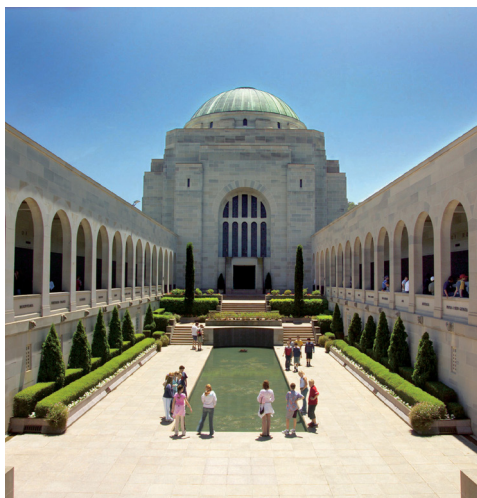
Our visit to the Australian War Memorial includes entrance to the Last Post Ceremony