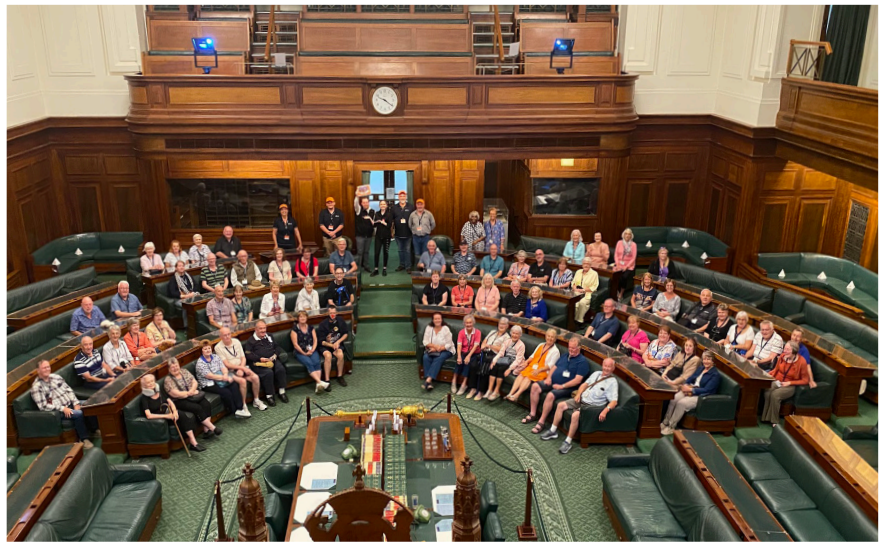
Enjoy a private tour and lunch at the Museum of Australian Democracy at Old Parliament House