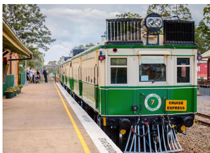
CPH 1,3 & 7 are three of a class of 37 railmotors built in the 1920s. They provide a unique heritage rail experience with windows that open

Reboard the railmotors and journey to Goulburn for a quick leg stretch before returning to Sydney, Gosford or Broadmeadow - B,L