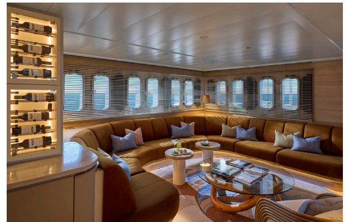
PASPALEY PEARL OCEAN LOUNGE & DINING ROOM