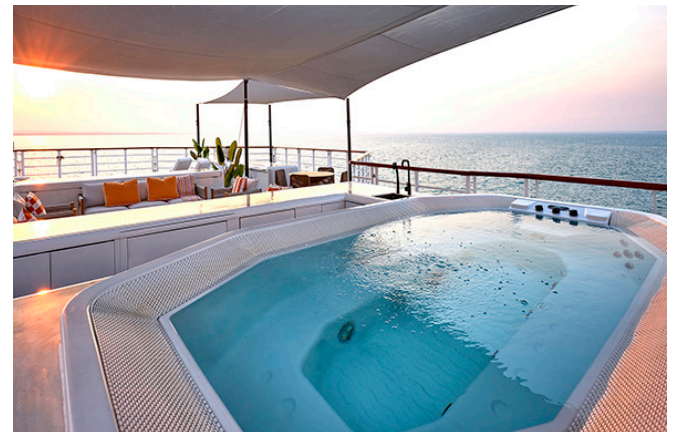
PASPALEY PEARL HORIZON DECK / SUN DECK