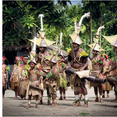
PAPAU NEW GUINEA