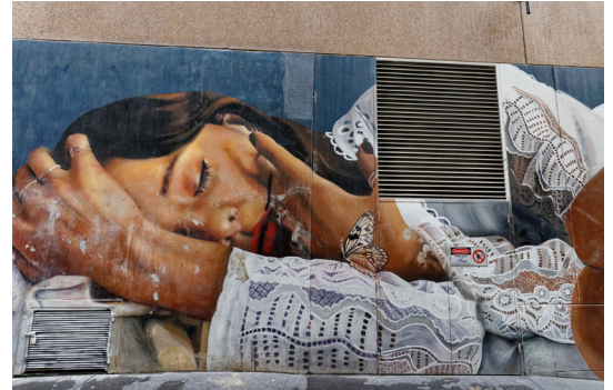
Right - Our centrally located hotel allows easy exploration of Melbourne with a full day to explore as you wish