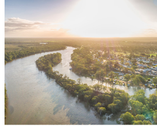
Left - Visit the remote town of Wentworth where the Murray and Darling Rivers meet