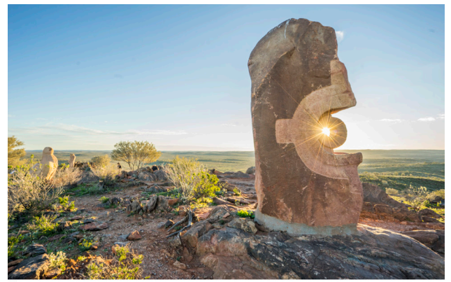
Above - Visit the Living Desert & Sculptures during our visit to Broken Hill