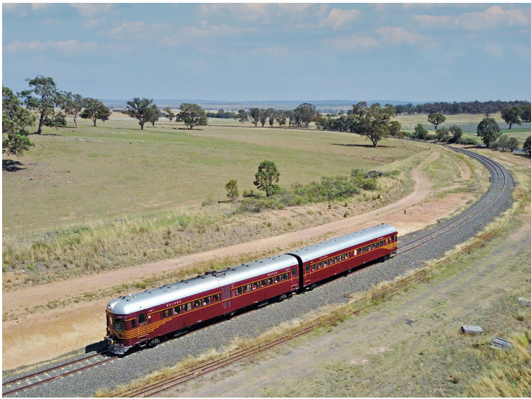
Above - Travel aboard a 1960's built heritage railmotor from Sydney to Rylstone, Tarana, Bathurst, Parkes and Broken Hill